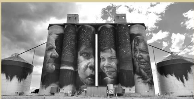
Sheep Hills, Adnate