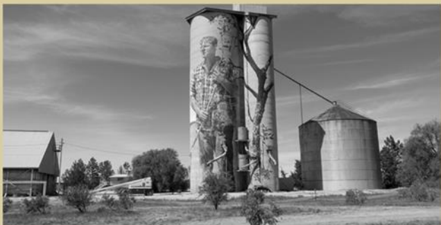
Patchewollock, Fintan Magee